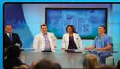
The ML830® Laser was featured on CBS, "The Doctors"

ML830® Laser is a non-thermal laser capable of penetrating deep into tissue. Once delivered, the light energy promotes the process of photobiostimulation. In human tissue the resulting photochemical reaction produces an increase in the cellular metabolism rate that expedites cell repair and the stimulation of the immune, lymphatic and vascular systems. The net result, observed in clinical trials to date, is the apparent reduction in pain, inflammation, edema and overall reduction in healing time.